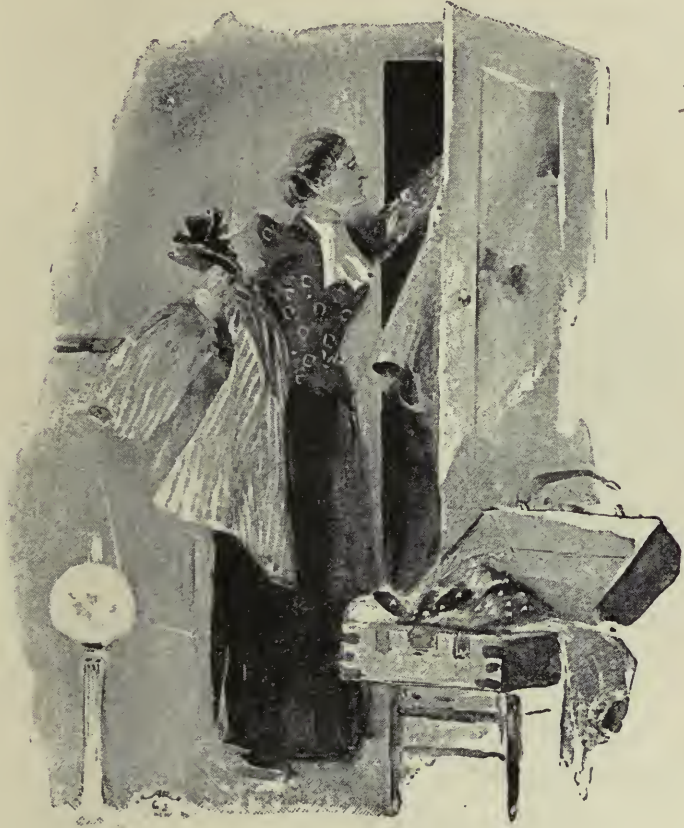
EVERYTHING WENT INTO IT.

unpacking. I said I was glad to see him, although he might possibly have read in my manner that I thought he should have given